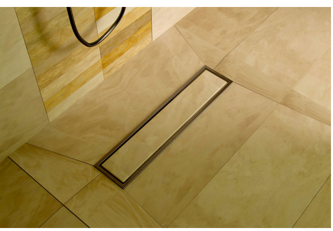
Linear drain—cover filled with tile.